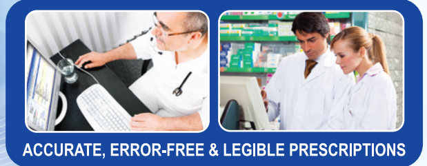
ACCURATE, ERROR-FREE & LEGIBLE PRESCRIPTIONS